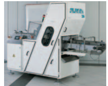
Hartmann Selectra 30

Hartmann manufactures a comprehensive range of high performance splitters, slicers and baggers which, when combined with the outstanding capabilities of SR Pack's automatic box and tray fillers, stacking/restacking and palletising machines, offers bakeries high levels of automation and production flexibility. • www.aewdelford.com/bakeryautomation.htm