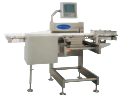
AEW Delford Systems Guardian 2200

The Guardian 2200 Multipurpose checkweigher with optional integral metal detector provides a number of important benefits for a wide range of packaging applications, not least of which is the significant contribution it makes to reducing the length of production lines. It is one of the most accurate checkweighers around, with accuracy levels down to an impressive 0.5g, throughput of up to 180 packs/min and an easy to use control panel that features a 500 programme memory for fast product changeover. • www.aewdelford.com/guardian2200