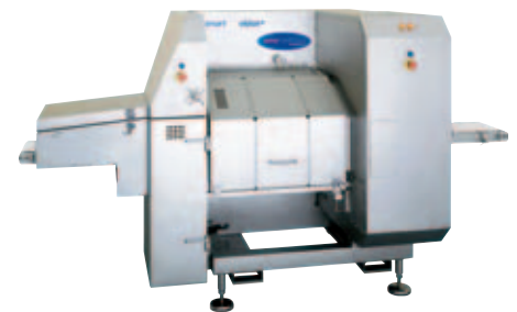
AEW Delford Systems SmartSlice Vision+