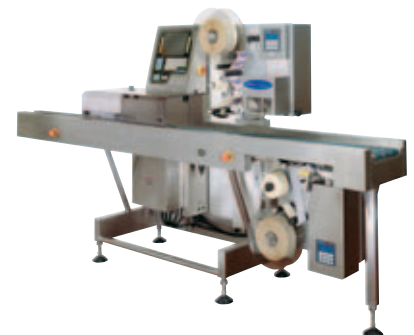
AEW Delford Systems 8100 Weigh Price Labeller