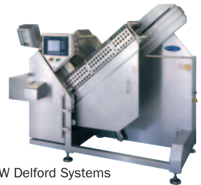
AEW Delford Systems Polyslicer Vision