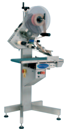
AEW Delford Systems LS40 Label Applicator