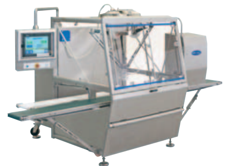
AEW Delford Systems IPL Robot

Combine the speed, versatility and productivity of PolySlicer Vision with IPL Robot and you have the ideal, high output production system that requires the absolute minimum of labour. IPL Robot picks up single or multiple portions of fresh or frozen portions of just about any product and places them quickly, gently and accurately, in any format, into trays or a thermoformer. A single vision and control system can handle up to six robots, each of which can perform various tasks and certain grading options. • www.aewdelford.com/iprobot